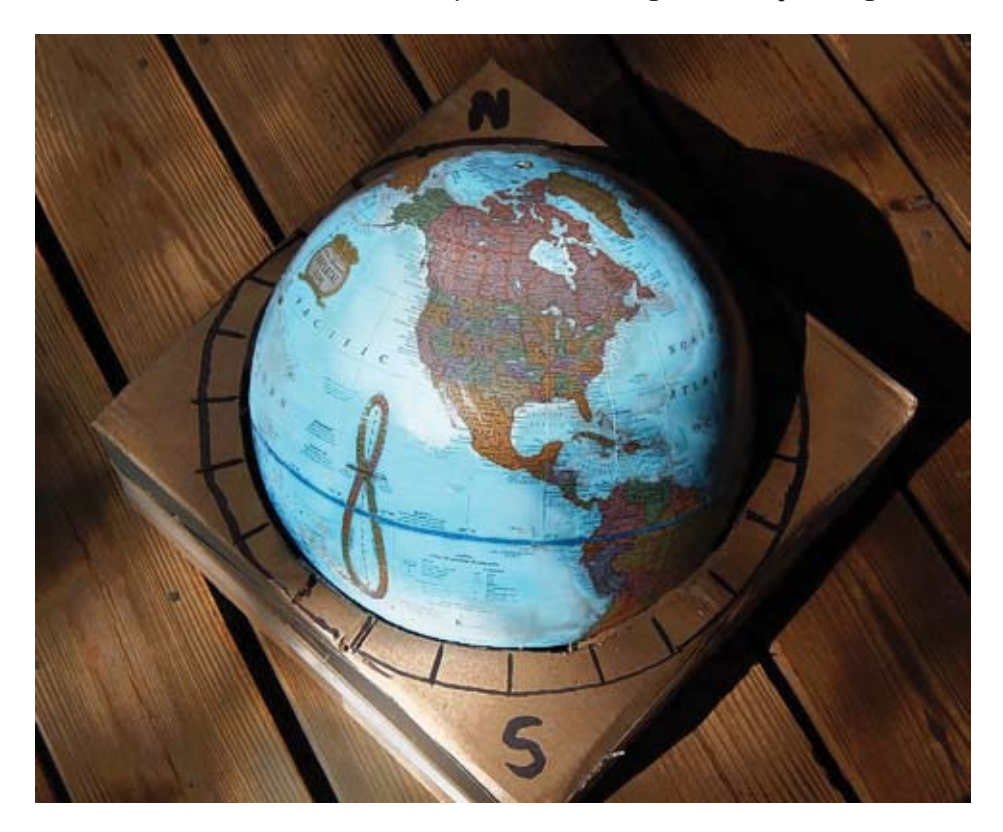
Question 1: Which North America should we learn to draw?

Old Michigan GLCE 6 - G1.1.2 Draw a sketch map from memory of the Western Hemisphere showing the major regions.